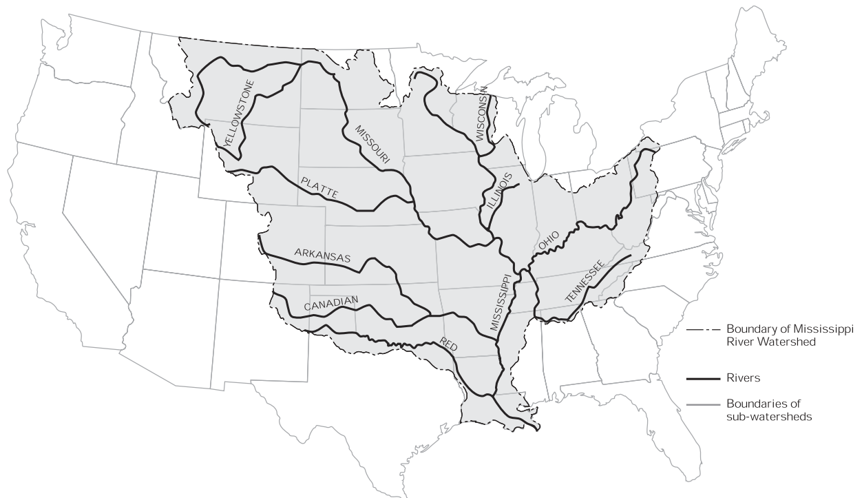
FIGURE 1.1. The Mississippi River watershed is made up of many smaller sub-watersheds.

No two watersheds are exactly alike. The boundaries and characteristics of a watershed depend on many factors, including the geology of the region. What type of bedrock lies under the soils? Is the terrain steep and hilly, or broad and flat? Are there volcanoes in the area? Have glaciers covered the land in the distant past, leaving behind vast deposits of sand and gravel?